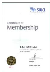
SWA SINGAPORE WATER ASSOCIATION