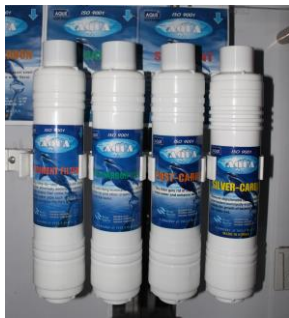
FOUR STAGE WATER FILTRATION (Korean Origin)