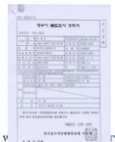
(Korean Water Purifier Industry Cooperation)