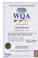
WQA (Water Quality Association)