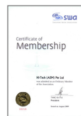
SWA SINGAPORE WATER ASSOCIATION

*May vary depending on local water quality and water flow rate