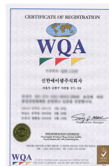
WQA (Water Quality Association)