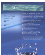
ISO 9001 CERTIFICATE

*May vary depending on local water quality and water flow rate