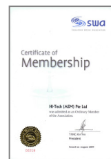
SWA SINGAPORE WATER ASSOCIATION