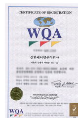
WQA (Water Quality Association)