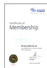
SWA SINGAPORE WATER ASSOCIATION