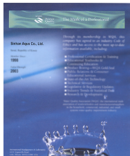
ISO 9001 CERTIFICATE

*May vary depending on local water quality and water flow rate