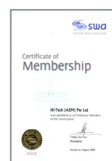
SWA SINGAPORE WATER ASSOCIATION