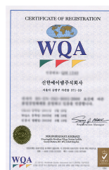
WQA (Water Quality Association)