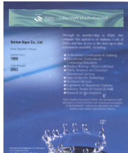
ISO 9001 CERTIFICATE

是利用有較強吸附力之含碳物質，以吸附水中之污染物及不良氣味。一般分為木炭、粒狀活性碳、粉狀活性碳 和壓製碳塊、加銀活性碳等。