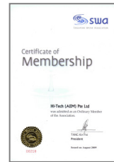
SWA SINGAPORE WATER ASSOCIATION