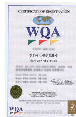
WQA (Water Quality Association)