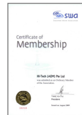
SWA SINGAPORE WATER ASSOCIATION