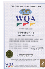
WQA (Water Quality Association)