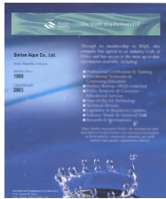
ISO 9001 CERTIFICATE

www.hitechaem.com contact@hitechaem.com ROC No: 199205407G GST No.M2-0109882-3