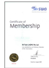
SWA SINGAPORE WATER ASSOCIATION