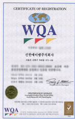
ISO 9001 CERTIFICATE

3rd Stage Dimensions Filtration Flow Rate Maximum Pressure Maximum Temperature Service Life Function