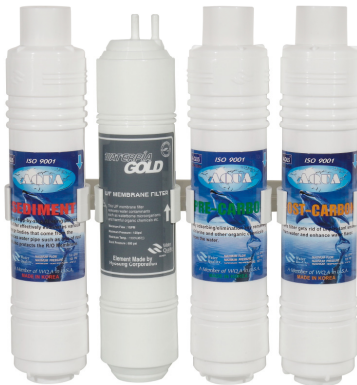
FOUR STAGE WATER FILTRATION (Korean Origin)

1st Stage Dimensions Filtration Flow Rate Maximum Pressure Maximum Temperature Service Life Function