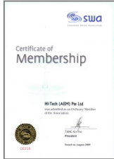
SWA SINGAPORE WATER ASSOCIATION

www.hitechaem.com contact@hitechaem.com ROC No: 199205407 GST No.M2-0109882-3