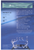
ISO 9001 CERTIFICATE

Activated Carbon Filter 活性炭 12" x 2½" 1.0 GPM 125 PSI 120° F 2500 Gallons (9,375 litres)* Activated Carbon filter absorbs / reduces chlorine, pesticides, herbicides and other harmful organic chemicals from the water to enhance safety and freshness in drinking.