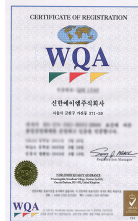
WQA (Water Quality Association)