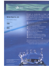
ISO 9001 CERTIFICATE