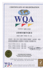
WQA (Water Quality Association)