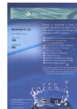
ISO 9001 CERTIFICATE