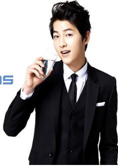
Song Joong Ki, the face of RUHENS