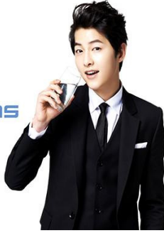
Song Joong Ki, the face of RUHENS