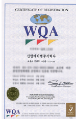
WQA (Water Quality Association)