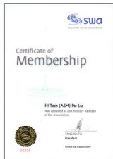
SWA SINGAPORE WATER ASSOCIATION