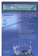
ISO 9001 CERTIFICATE