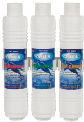
THREE STAGE WATER FILTRATION (Korean Origin)

Replacement package @ $110 per trip @ Contract basis