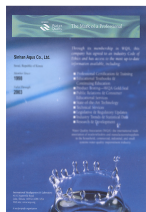
ISO 9001 CERTIFICATE