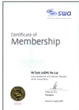
SWA SINGAPORE WATER ASSOCIATION