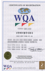
WQA (Water Quality Association)