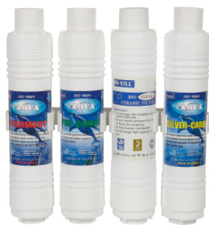
FOUR - STAGE WATER FILTRATION (Korean Origin)