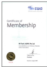
SWA SINGAPORE WATER ASSOCIATION