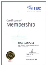
SWA SINGAPORE WATER ASSOCIATION