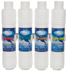
FOUR STAGE WATER FILTRATION (Korean Origin)